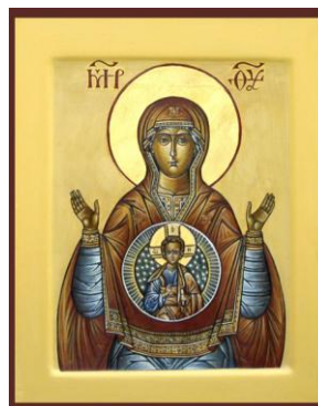
Theotokos Of Orans

This basic gesture of pleading is ancient in the human history of prayer.